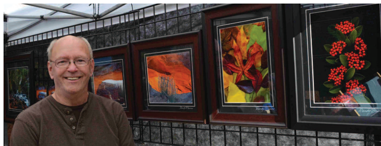
Artist in an outside booth at Forest of Arts.