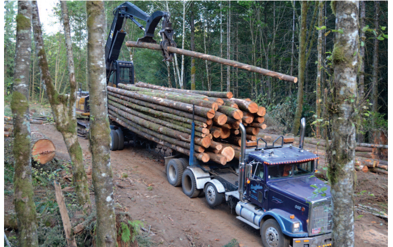
Products on their way to the market.

Following logging, the slash and brush was piled by Ken Stone using an excavator equipped with a brush rake. Nearly 30, tall, dirt-free piles have