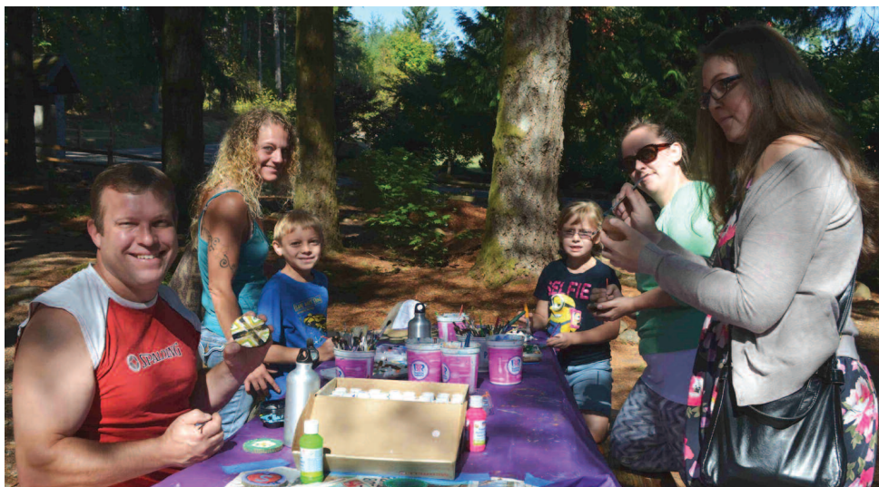
Hands on art, making tree cookies.

For more information, call: 503-632-2150 or visit: www.demonstrationforest.org