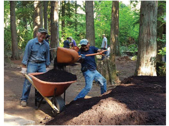
Sprucing up for Forest of Arts