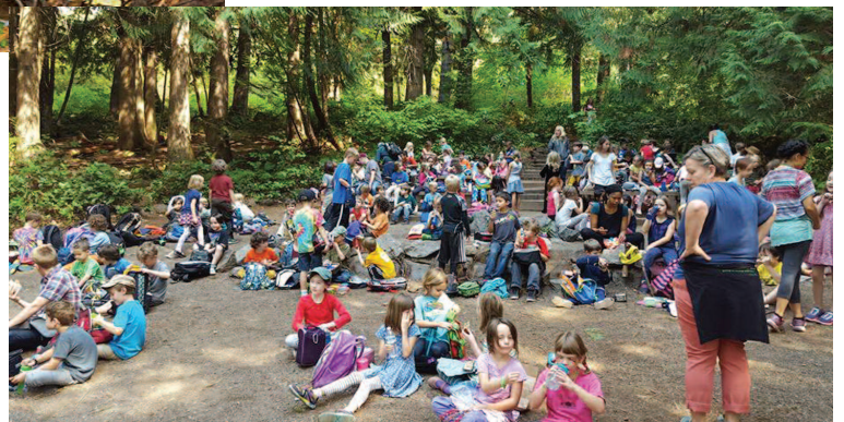
Sunnyside Elementary School