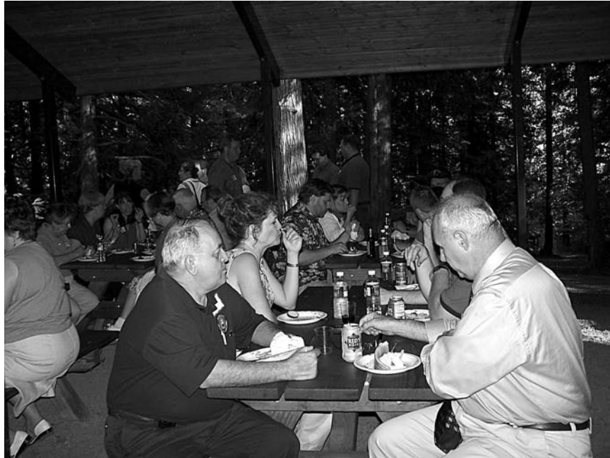
Forests Forever Board members and staff hosted a Business After Hours event for the North Clackamas County and Oregon City Chambers of Commerce—Chamber members enjoyed BBQ and networking at Hopkins Memorial Tree Farm.

GOAL 2 Offer a Variety of On-site Programming and Community Education: maintain regular open hours; offer tours, host community events, facilitate forestry skills workshops and other educational programs for the community.