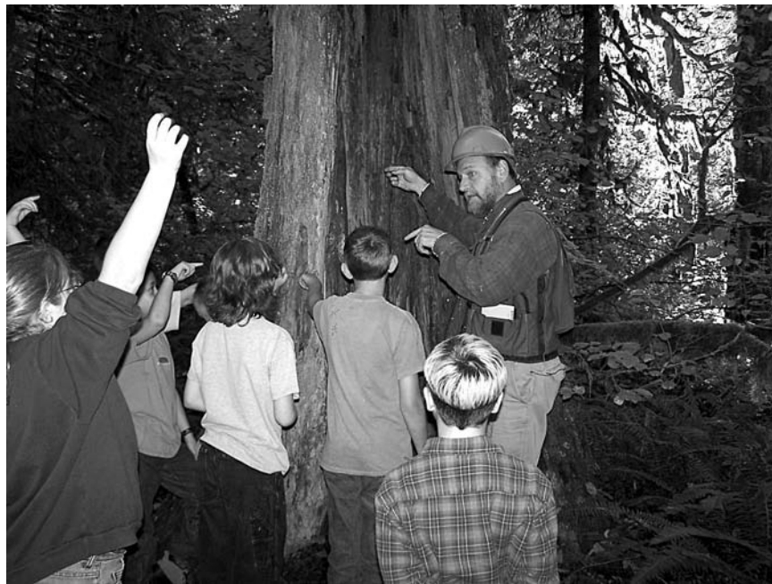
Fourth and fifth-graders from area elementary schools ponder the origins of a large hollow stump they found along the Watershed Interpretive Trail at Hopkins Memorial Tree Farm. Both FFI staff and other educators and volunteers provide an increasing number of out-of-school programs at the tree farm.