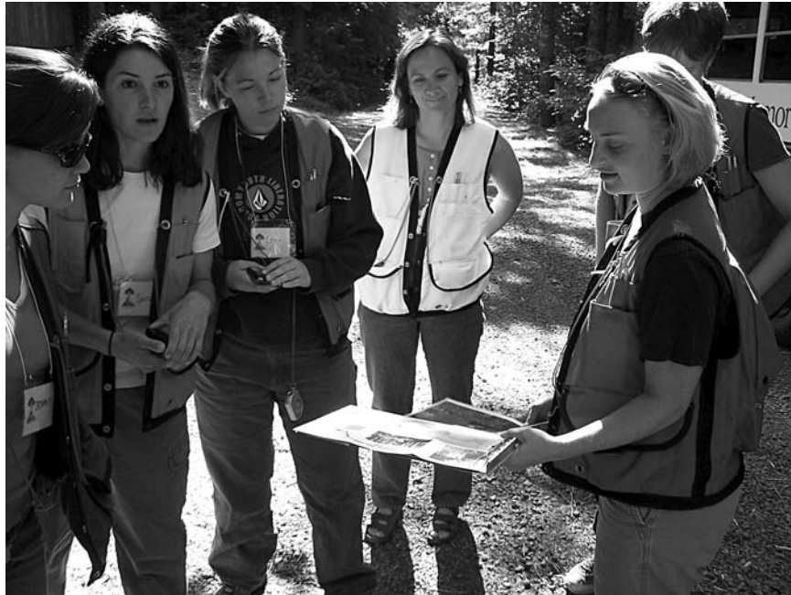
Wolfree, Inc. Staff train volunteers in methods to support Science in the Forest and similar youth education programs at Hopkins Memorial Tree Farm.

Volunteers help Forests Forever in many ways at Hopkins Memorial Tree Farm. We rely on volunteers' talent and time to make minor upgrades to facilities, and improve the accessibility trails and exhibits at the tree farm. Volunteers assist with managing and maintaining our large inventory of forestry tools used in resource management and education programs. Volunteers even kept an eye on the tree farm while staff went on vacation this past summer!