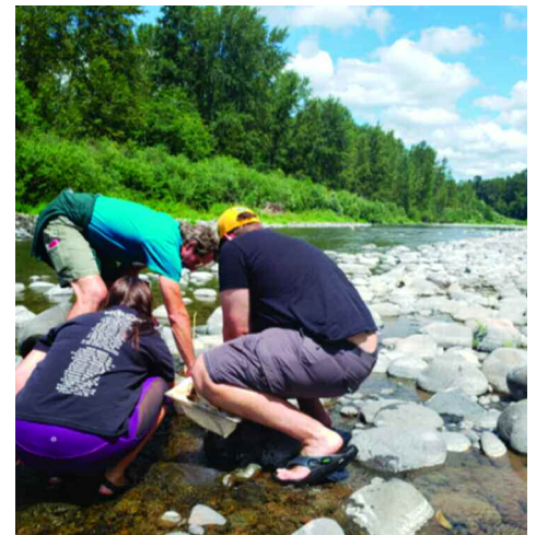
Schink property's Molalla River frontage.