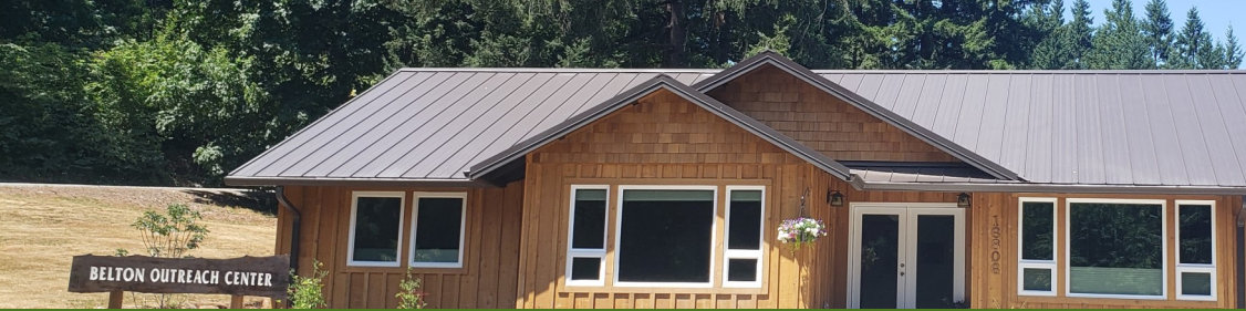
BELTON OUTREACH CENTER