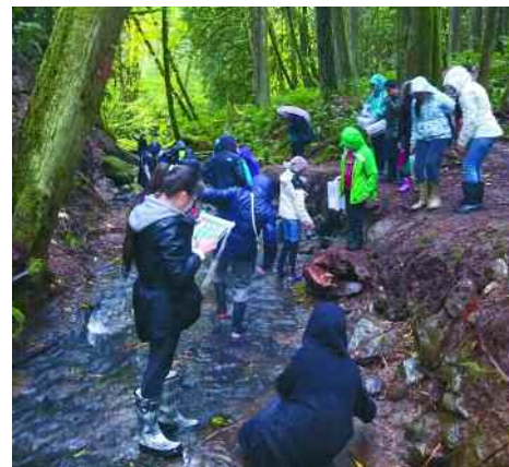
Students from Trost Elementary

More and more new schools are finding us. Starting in the fall of 2016, there has been a significant increase in primary (grades K-2) and elementary (grades 3-5) school groups coming to Hopkins from a range of areas. Some of these schools have been local—like Canby, Molalla, and