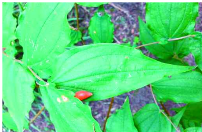
Disporum smithii also Prosartes smithii

Apparently this plant is about beauty, not utility.