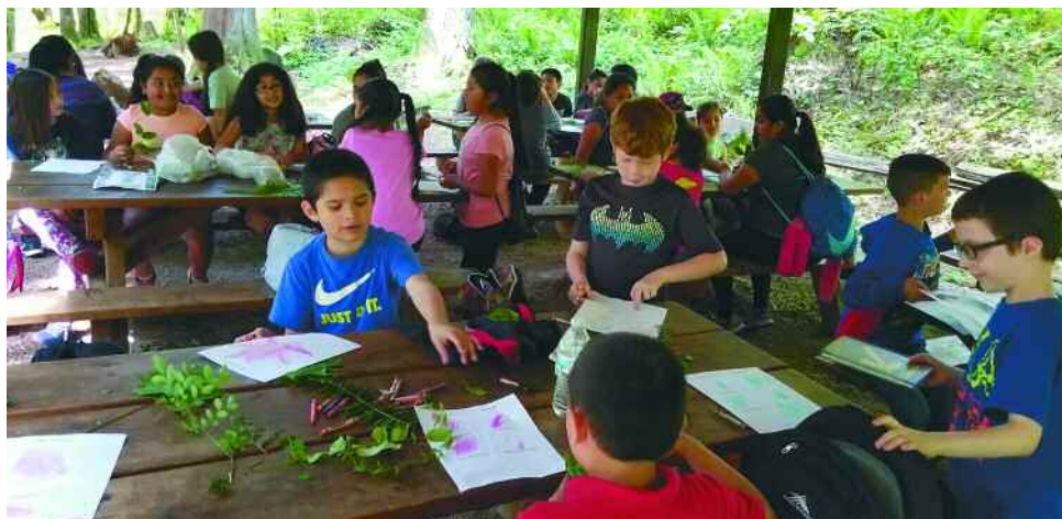
Molalla students identify native plants.