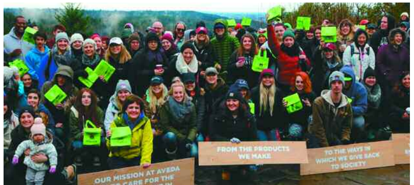
Dosha-Aveda fundraising kickoff event at Hopkins Demonstration Forest.