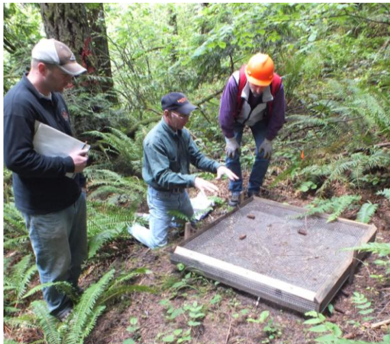
Teachers in the Woods participants collected material from seedfall traps in the Uneven-age Management Demonstration.