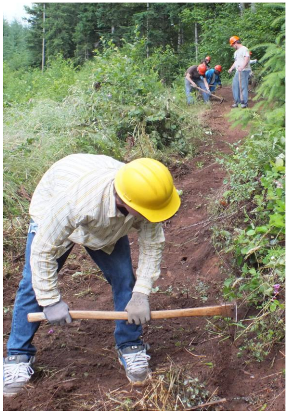
Long-term, ongoing service-learning programs developed in 2011 for Canby Youth Corps, the DePaul Center, and Parrott Creek Ranch engaged dozens of youth, multiple times each.

Self-directed Programs are those not requiring direct involvement by Hopkins education staff in program presentation. Staff assisted group leaders with activity planning, and coordinated some on-site logistics or loaned tools and materials. Self-directed activities are coordinated for audiences not usually served by Hopkins education staff, such as pre-school and primary grade students.