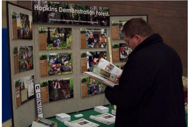
A portable display featuring community activities at Hopkins Demonstration Forest made the rounds of a half-dozen events, attended by almost 20,000 people in 2011 e.g., Tree School; Spring Garden Fair and Beavercreek Cooperative Telephone Backyard Bash.