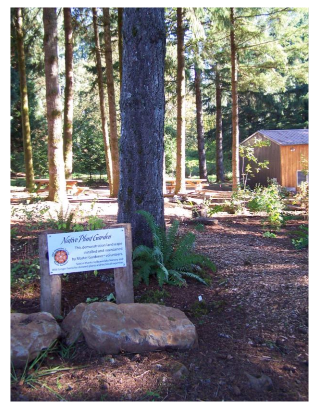
The Native Plant Demonstration Garden showcases a designed landscape that conserves water, provides for native wildlife and reduces the potential for fire to spread. The entire landscape is possible through the efforts of Master Gardener volunteers and plants donated by two local nurseries. Like all gardens, it is a labor of love and is ever-changing.

Volunteers are essential to the success of Forests Forever in its management of Hopkins Demonstration Forest. In addition to organizational leadership, volunteers are responsible for daily operations, facilities management, and presentation of education programs. There are few places on the Hopkins property where the work of a volunteer is not visible. The evidence of volunteer efforts are found in bridges, fences, trails, kiosks, picnic table, planted and tubed seedlings, stacked firewood, pruned trees, engaged youth and more. Volunteers at Hopkins are young and old, some with forestry backgrounds and interests, yet most are novices. Some highlights of volunteer activities in 2011 follow.