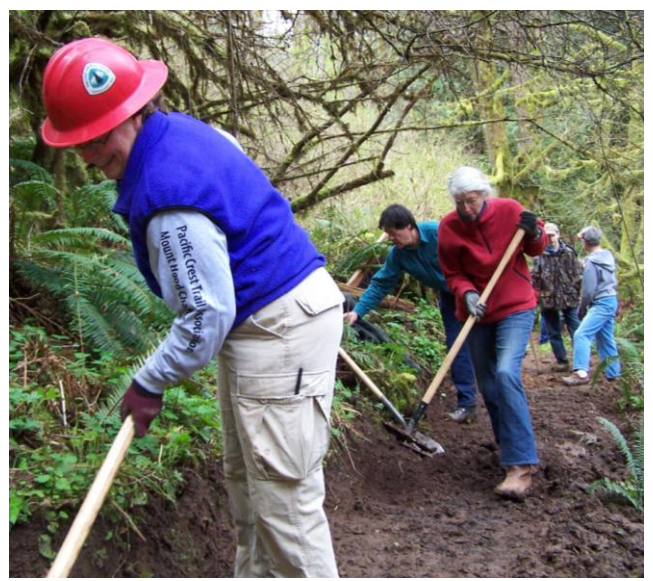
Pacific Crest trail Association crew leaders shared their knowledge and skills with other volunteers who came to repair some of the more popular hiking trails in the Hopkins Forest.

Community Forestry Days are held the second Saturday each month. There are different "tree farm chores" offered to a community of eager volunteers. The model for Community Forestry Day is to mix the skills and knowledge of experienced project leaders with a variety of novices from the community. More than 200 volunteers participated in Community Forestry Days in 2011.