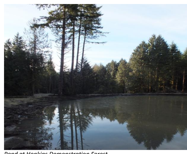
Pond at Hopkins Demonstration Forest.

A focus of activity around the ponds included clearing adjacent red alder and removal of brushy vegetation prior to emptying and digging sediment from the upper pond. With technical support from Oregon Department of Forestry and funding through Clackamas County Soil and Water Conservation District, the re-developed ponds will provide improved access to water in case of fire emergency on the Hopkins property. Work around the ponds will continue in 2012.