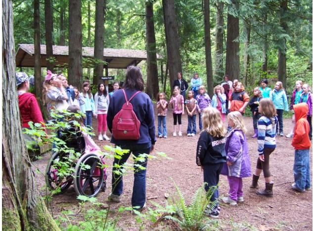
Two older girls organized an entire day of Girl Scout activities for 60 younger girls – singing, arts and crafts, plant identification and a guided nature walk.

Scout activities at Hopkins in 2011 included completion of requirements for two Girl Scout Silver Awards (2<sup>nd</sup> highest), while two Boy Scouts completed requirements for their Eagle Rank. Several local packs and troops continue to use Hopkins for a variety of scouting activities.