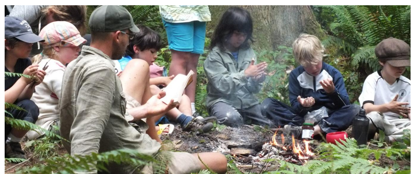
My Side of the Mountain campers mixed "ash cakes" in their hands to cook on a small fire, as they lived out the story that was being read to them.

Partner organizations provide unique programming and opportunities for audiences not usually served by Hopkins education staff. These arrangements extend the potential outreach and community engagement in the Hopkins mission beyond that which staff is able to accomplish alone.