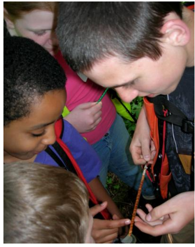
A Canby Youth Corps student helps a study team of local fifth-graders interpret a treecore sample.

support from Portland State University students and an extensive cadre of trained resource professionals who volunteer to mentor students in small science teams. Students use forest inventory tools and field guides to explore forest ecology.