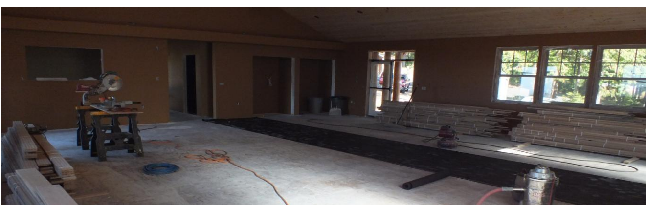
Forest Hall flooring and installation.

The maple trimmed interior cedar pillars at the front entrance come from Hopkins!