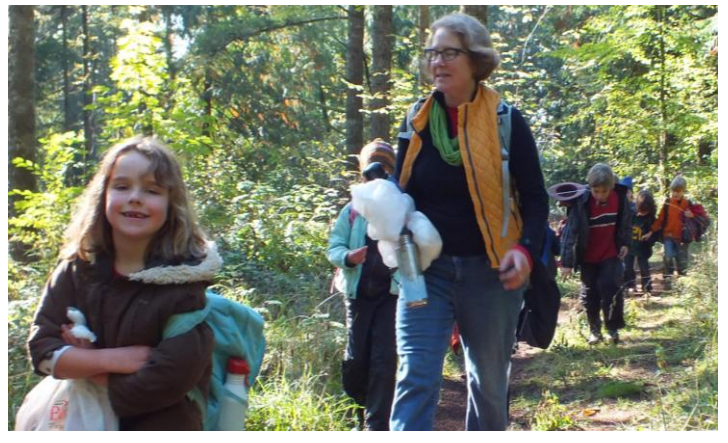
Hopkins Demonstration Forest is a great place to immerse children in a forest setting. Over 300 young children swarmed Hopkins in 2011 learning through play as they naturally do.

challenged teens and college students to develop products and businesses based on nontimber forest resources. Firewood was one natural product that two teen groups processed and marketed. Other youth considered the business of walking sticks and wood art. One college student looked into ways to reduce logging slash by creating products such as charcoal and wood chips for meat smoking.