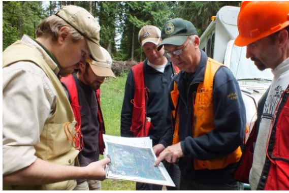
Integral to Teachers in the Woods 2011 experience were opportunities to interact with several resource professionals. Among them, Oregon Department of Forestry staff helped the teacher-team understand application of the riparian forestry rules as an introduction to a riparian tree marking project.

Teachers in the Woods 2011 included three dedicated teachers who completed three important field projects as their learning process. During their four week experience, teachers completed: riparian tree marking, timber sale preparation and seed collection. In addition the teachers assisted with youth programming and community outreach. They also devised lessons and collected resources for use in their respective classrooms.