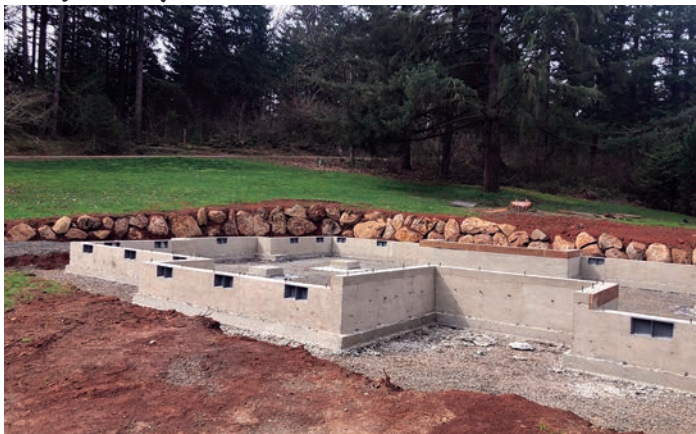
The foundation was formed and poured this past winter—we're ready for the walls!