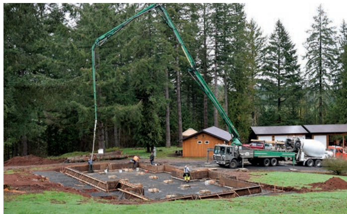
Construction of the new Forestry and Natural Resources Outreach Center at Hopkins Demonstration Forest.

Besides these special naming opportunities, a key part of our fundraising campaign for the Outreach Center will be growing our two endowments established by the Hunter and Poppino families. These endowments support our main mission at FFI—education and